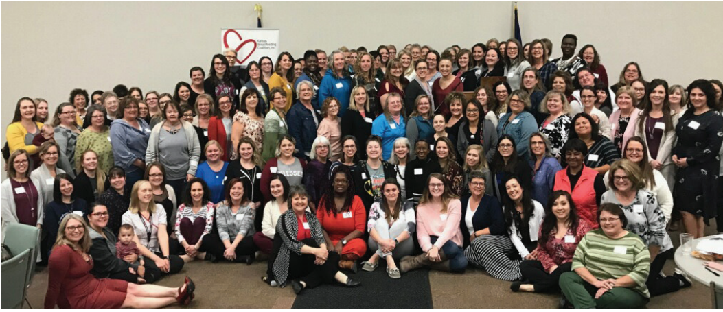
Pictured: The 2018 Kansas Breastfeeding Coalition Conference