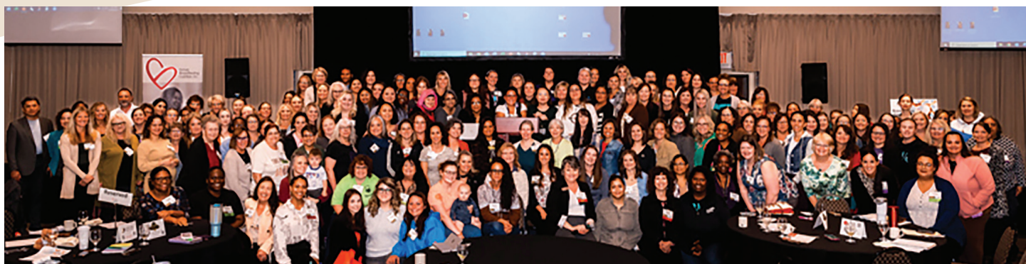
Pictured: The 2023 Kansas Breastfeeding Coalition Conference